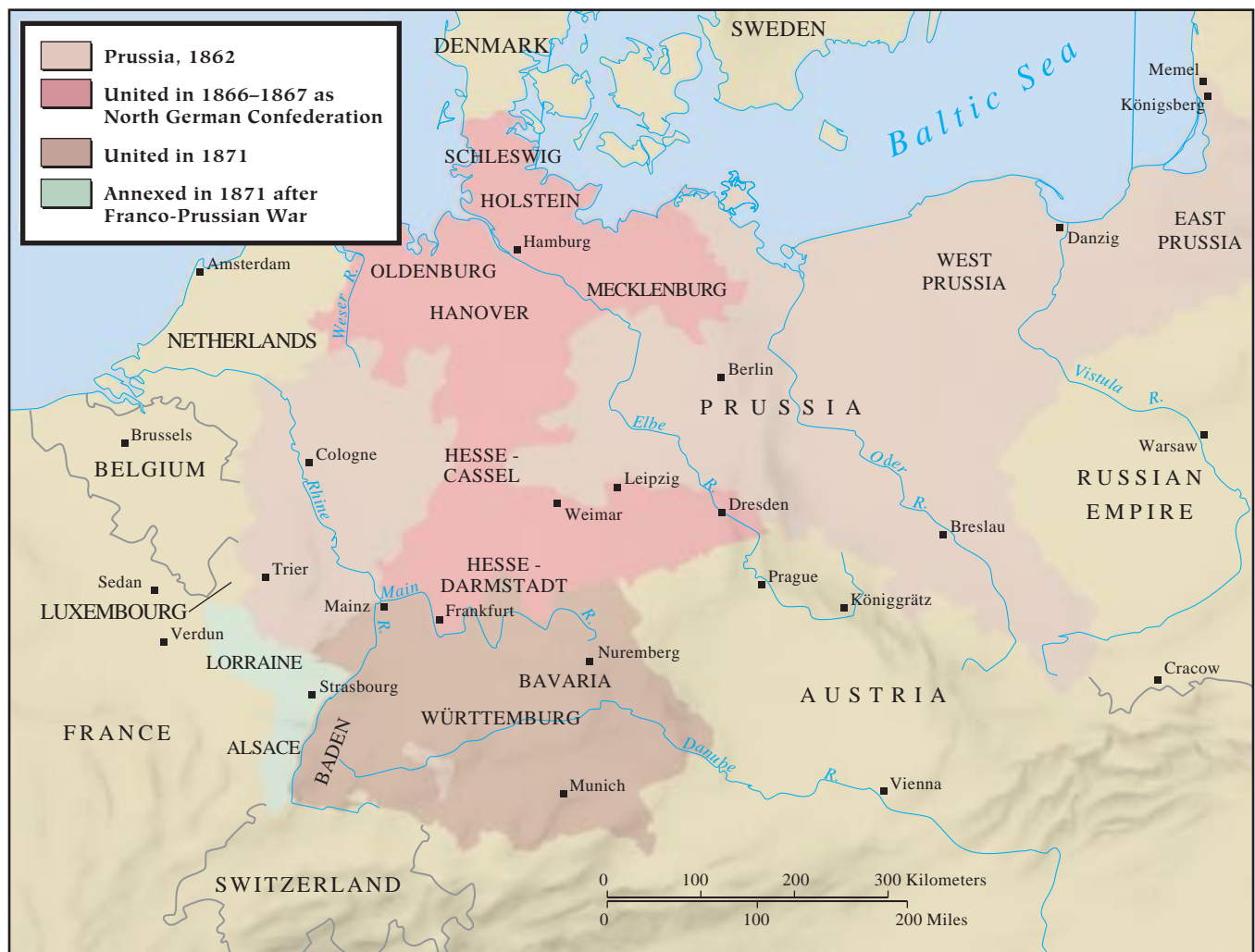
MAP 22.2 The Unification of Germany.

He showed the same flexibility in the creation of a new constitution for the North German Confederation. Each German state kept its own local government, but the king of Prussia was head of the confederation while the